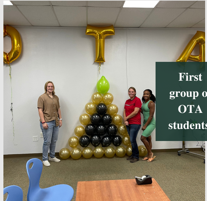
First group of OTA students

During their orientation, the students received their uniforms, and OTA kits and participated in the logo design for the program.