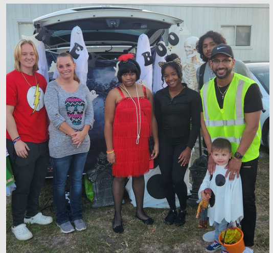
28th Oct - Babson Park, FL - OTA students participated in the Webber International University trunk or treat.